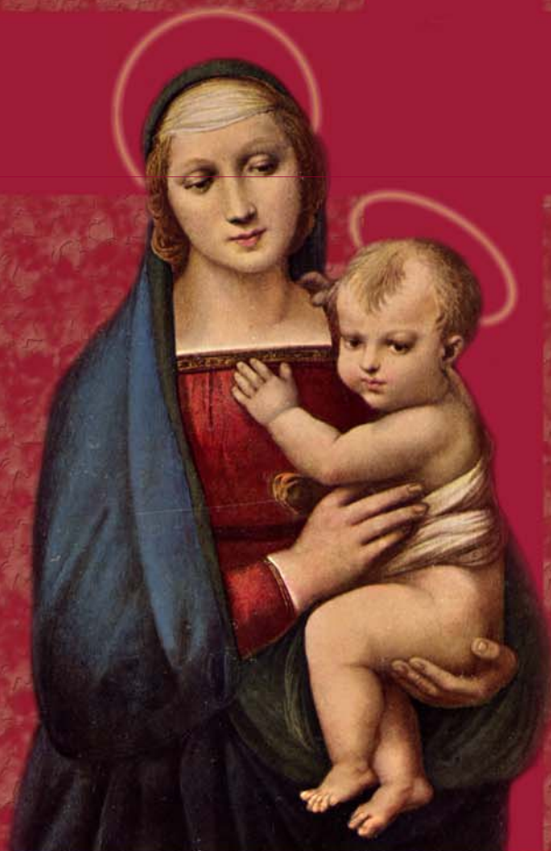
Madonna Del Granduca

Our mission is to foster the spiritual growth of our Parishioners, to reach out to the community, and to spread the Word of God.