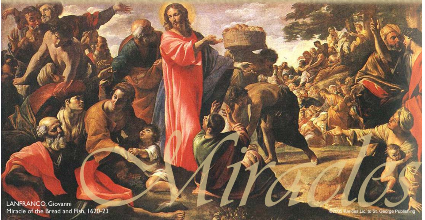
LANFRANCO, Giovanni Miracle of the Bread and Fish, 1620-23