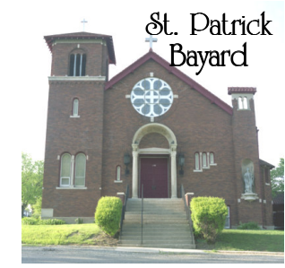
St. Patrick Bayard