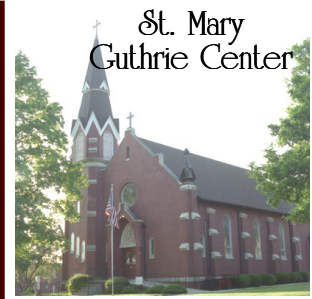
St. Mary Guthrie Center