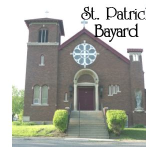
St. Patrick Bayard