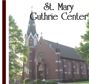
St. Mary Guthrie Center