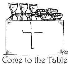
Come to the Table

Did you know that by 6 weeks plus 2 days after conception the brain waves of an unborn child can be recorded by EEG (electroencephalogram).