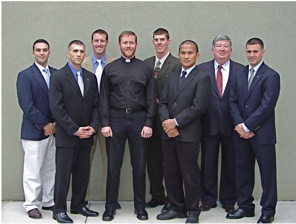
Left to right; Here are our new 3rd Degree Members