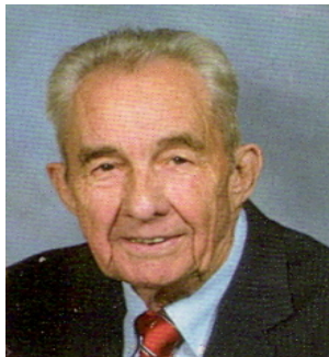
Our Sir Knight for The Month Of December 2008