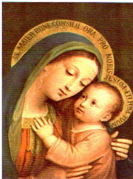
Our Lady of Good Counsel, Pray for Us